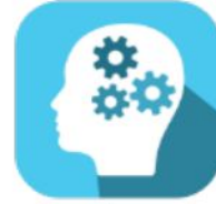
Creative and Critical Thinker