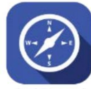
Goal-Directed and Resilient Individual