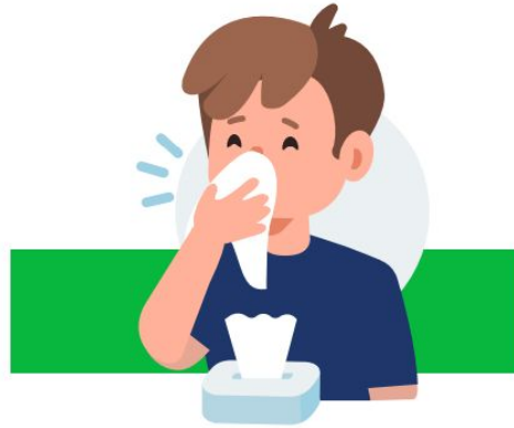
Send to school:

Protocols have been updated since the height of the pandemic. Students with a light cough, runny nose, or stomach ache should come to school. Students will no longer be sent home for these symptoms alone.