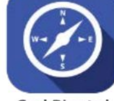
Goal-Directed and Resilient Individual