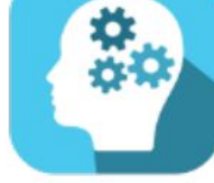
Creative and Critical Thinker